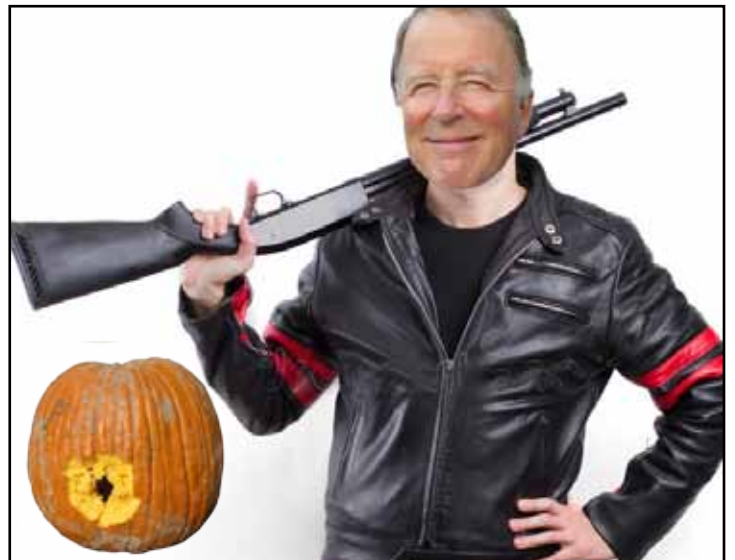
SHOTGUN PUMPKIN CARVING

Pay for lunch, happy dollars, or just a good old donation. Keep the dream alive https://beverlyrotaryclub.ejoinme.org/MyEvents/COVIDRESPONSE/tabid/1143470/Default.aspx